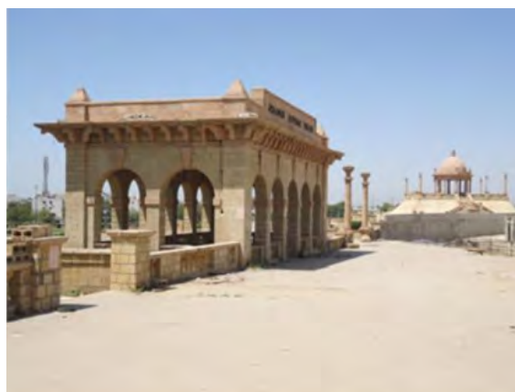
Figure 5. The Band Stand as seen today