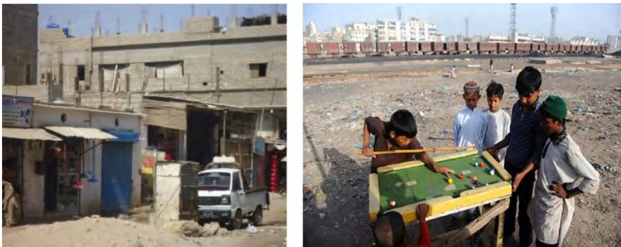
Figure 13. Economic (left) and entertainment (right) activities along the railway lines in Generalabad

The open area around the railway lines provides opportunities for different types of economic activities to spring up informally, which cater to the locality of Generalabad. Activities like grocery shops and gaming areas are seen along the railway lines. The gaming area around the snooker table (called dubbo locally) (Figure 15) is an important socializing area for the residents too, especially men and young boys but not women because women stay indoor due to social and cultural norms.