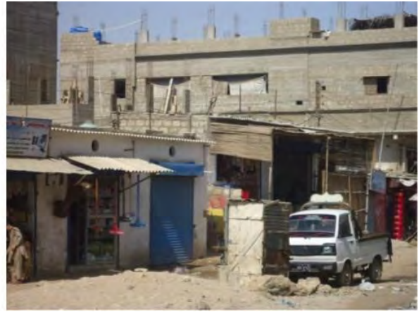
Figure 7. The ground plus one residential development in Generalabad