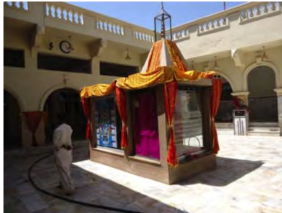
Figure 3. Mahadev Temple in Clifton

Kehkashan Clifton covers an area of 1,950 acres and was sanctioned by the Government of Pakistan in October 1964. This scheme was meant as a recreational-cum-high income residential scheme for bungalows and multi-storied flats on plots varying from 600 to 4,500 square yards. This scheme was meant to extend the city right up to the sea eliminating marshes and sandy wastes providing space for a population of 150,000 (KDA, 1969) (Figure 6). It had to grapple with many technical issues, the most important being land consolidation and reclamation. A well-established network of main streets, service lanes, pedestrian paths and connector roads were inherent characteristic of the scheme.