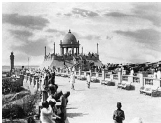
Figure 4. The Band Stand as seen in 19 th century