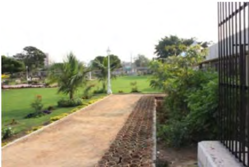
Figure 11. The parks of Clifton Block 5