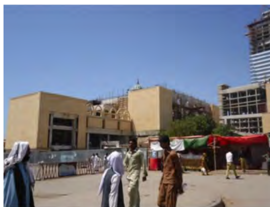
Figure 2. The new face of the Mausoleum of Abdullah Shah Ghazi

The locality houses, the Mausoleum of Abdullah Shah Ghazi, a saint who is venerated throughout the sub-continent, and attracts thousands of visitors daily (Figure 2). This Shrine dates from the 9 th century, and has acquired a landmark status over the years. There is also a temple next to the Mausoleum named Maha Dev Temple, which is equally venerated by Hindus and is believed to be a hundred and fifty-year-old structure (Figure 3). Both the Shrine and the Temple have been a part of the indigenous settlement of Karachi and have continued to be a major part of its history.