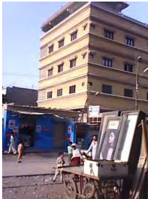
Figure 8. Newer building in the locality of Generalabad