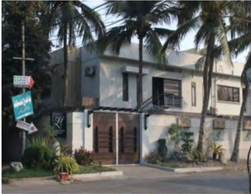
Figure 10. The houses in Clifton Block 5