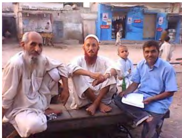
Figure 12. Jirgah along the Railway lines

The residents feel that the particularity of the neighborhood stems from the fact that the locality is in close proximity