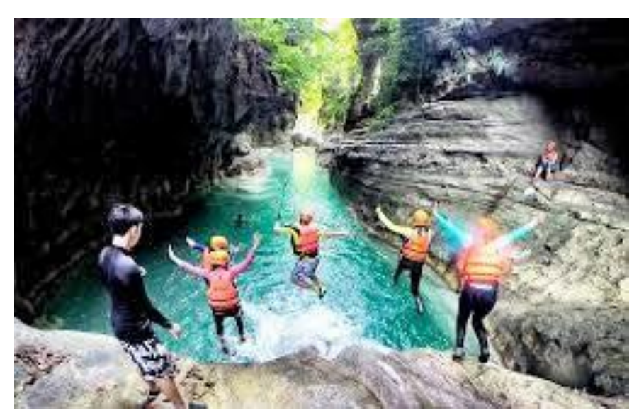
Figure 5. One of the activities people relished in Kawasan is the Canyoneering

Mustacisa/ Environmental Science and Sustainable Development