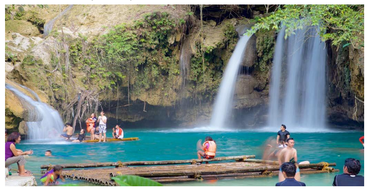
Figure 4. In the picture are people who enjoyed Kayaking out of a Bamboo