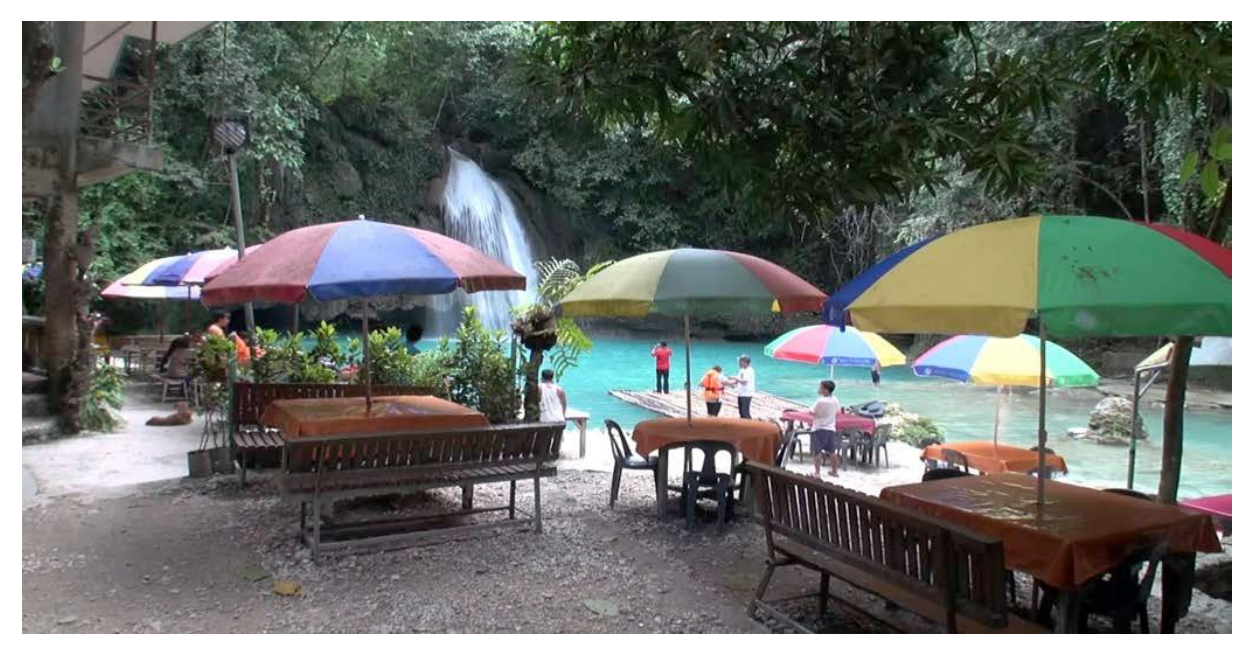
Figure 3. Showing the mess hall area located near the clean water of Kawasan

Collections of Pictures Taken from the Research Environment