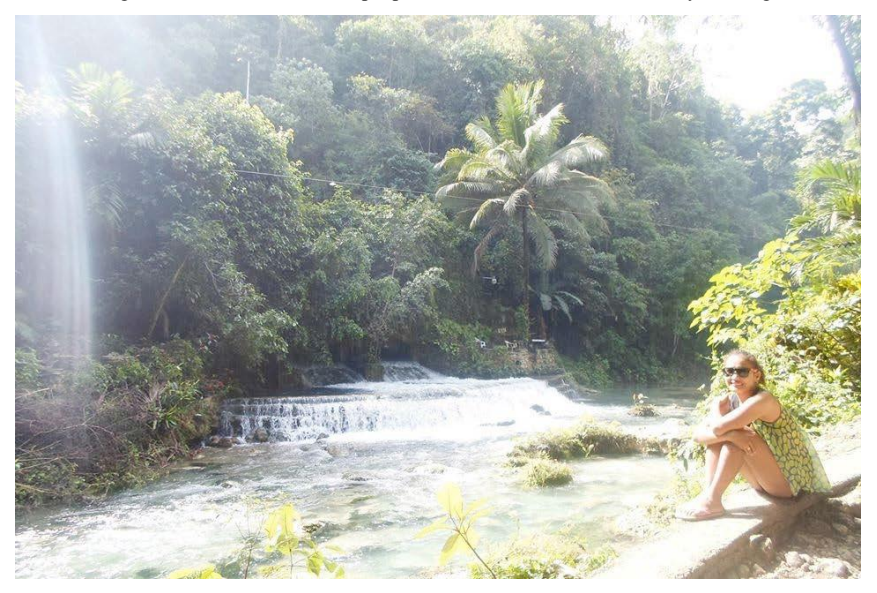
Figure 6. Kawasan is surrounded by preserved forest