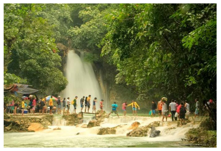
Figure 7. The passway of Kawasan which are made up of big rocks reached by flowing water