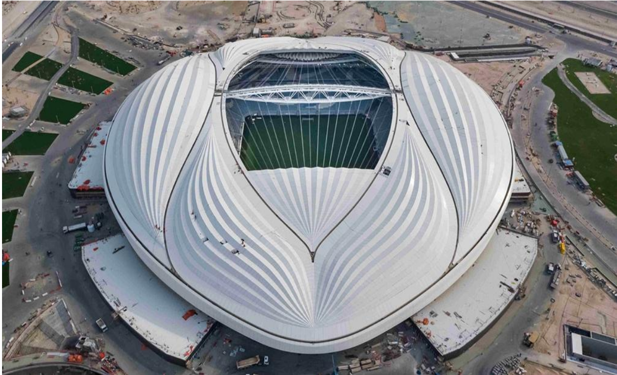
Figure 10. Al Janoub Stadium, Qatar