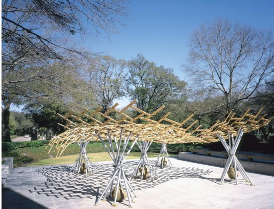
Figure 5. Bamboo Roof, Houston