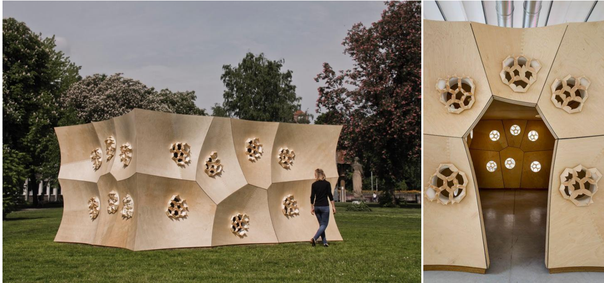
Figure 8. HygroSkin Pavilion, Stuttgart

The millimeter precision with which these elements have been carved, thanks to a 3D laser printer robot, allows HygroSkin to react naturally to the change of external weather conditions: simulating the behavior of the scales of the pinecone, when it rains and the humidity increases, the openings close up on themselves; while during the sunny days when the internal temperature increases the thin wooden sheets contract, increasing the width of the openings (Menges et al. 2015).