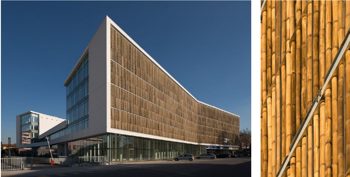
Figure 7. Bamboo brise soleil in the Stam Europe Green Place office building in Milan