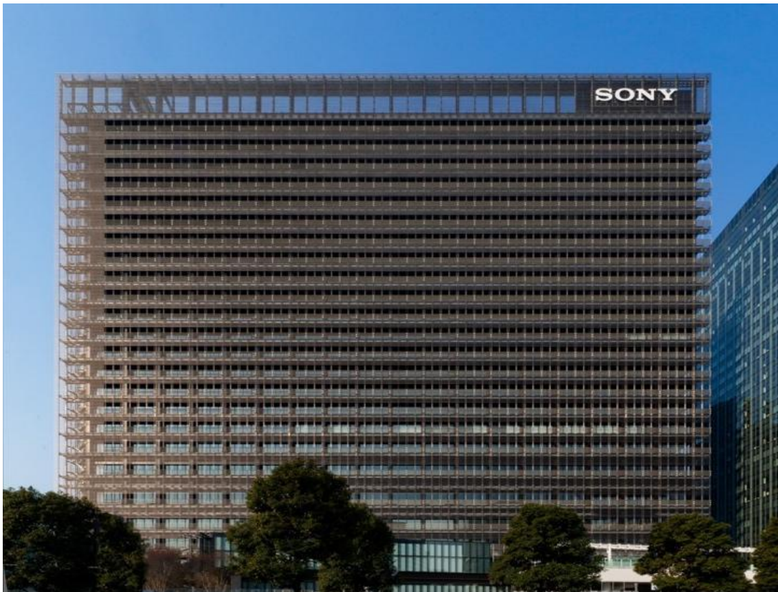
Figure 4. Bioskin of Sony City Osaki, Tokyo

The Bamboo Roof is characterized by a free-form roof structure that develops with unlimited geometric possibilities. The concept is both simple and complex at the same time. The structure is created by fitting together a series of units of parts, each made up of four bamboo boards connected together by metal pins. Finally, the corrugated roof is supported by metal supports. Bamboo Roof conveys a great sense of lightness and transparency, so much so that one has the perception of being under the canopy of a forest. These techniques represent an important reflection on the developments in the use of bamboo for construction in Italy.