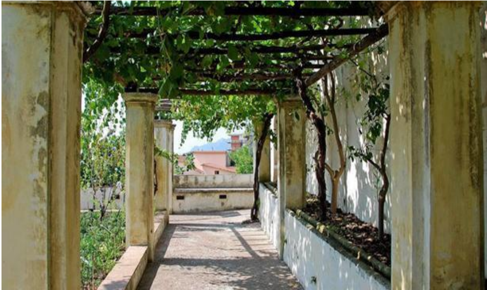
Figure 2. Vegetable pergola of the Giardino della Minerva, Salerno.