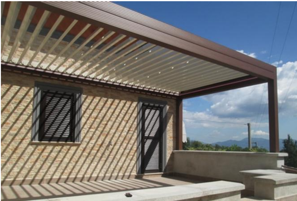
Figure 3. Bioclimatic pergola (Gibus)

The pergolas, which offer protection from atmospheric agents, can be completed with opening windows. The pergola, closed on all sides, with the possibility of opening the windows in summer and combining them with shading awnings, offers an ideal microclimate all year round: in summer, the windows that can be opened favor natural ventilation and the curtains shield the interior of the pergola from the sun. In winter, however, the closed windows protect against atmospheric agents.