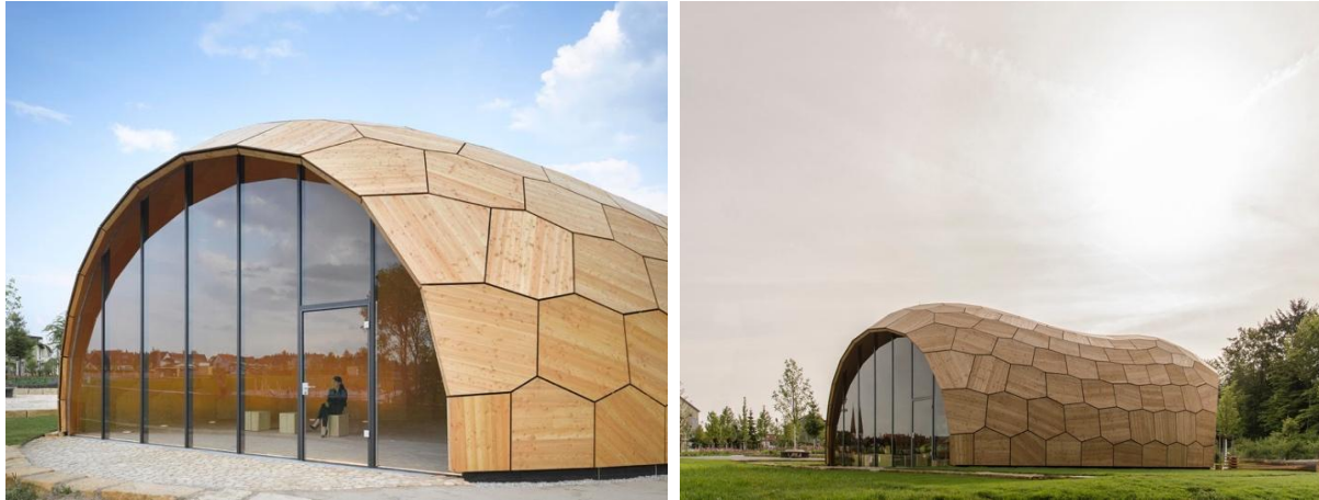
Figure 9. Landesgartenschau Exhibition hall, Stuttgart

characterized by speed of construction; very precise manufacturing; efficient and advanced detection methods; having a building shell and structure at the same time and striking visual effects inside and outside.