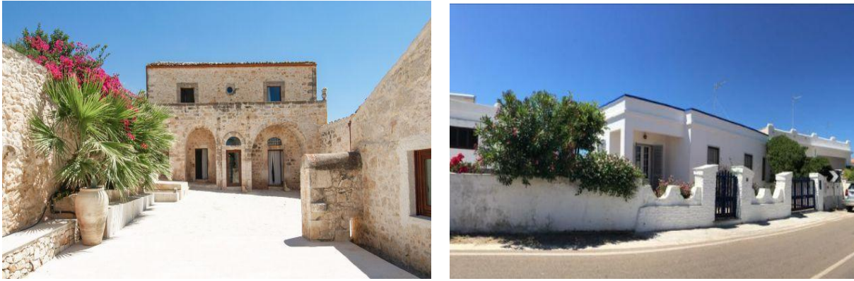
Figures 1. Typical Mediterranean massive houses

The shape of the building must also be related to the orientation. In Mediterranean architecture, southern exposure is preferred as the surfaces thus arranged receive the maximum winter radiation, while in summer the most affected surface is the roof and those located to the east and west. The Mediterranean buildings are characterized by a conformation that tends to favor the side facing south, in order to capture the sun's rays through the windows in winter, when the sun is low, and easily shield the glass surfaces from the sun's rays in summer, when the sun is high, with horizontal overhangs (balconies, loggias). The east and west sides are limited as much as possible since the openings on these sides carry little energy in winter, when the sun is weak and of limited duration (the solar path in winter is short), and overheating in summer, when the sun is low and goes deep. Generally, the north side, which never receives the sunlight (except at sunrise and sunset in summer), is characterized by openings reduced to a minimum to avoid dispersion and by a significant increase in the thermal insulation of the walls of buildings (Lavagna, 2008).