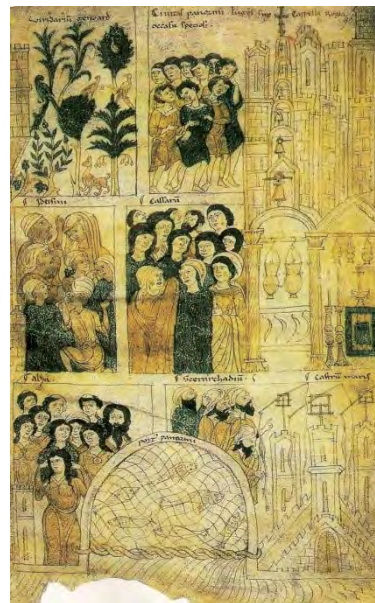
Figure 2. Funerals of William II. Neighborhoods of the ancient Palermo during Normans. Liberad Honorem Augusti di Pietro da Eboli, Berna Biblioteca Civica.

This image coincides, if only in part, with the descriptions given by Arab and medieval geographers. It also coincides with the activity of Norman, Suebi and Aragon kings who paid great attention to the use and maintenance of woods and forests. Even in the first cartographic representation (Pietro da Eboli, n.d., rep. 1994) the royal gardens — iconographically represented in a single quadrant — are illustrated with flowers, rare plants and predatory animals (lynx).