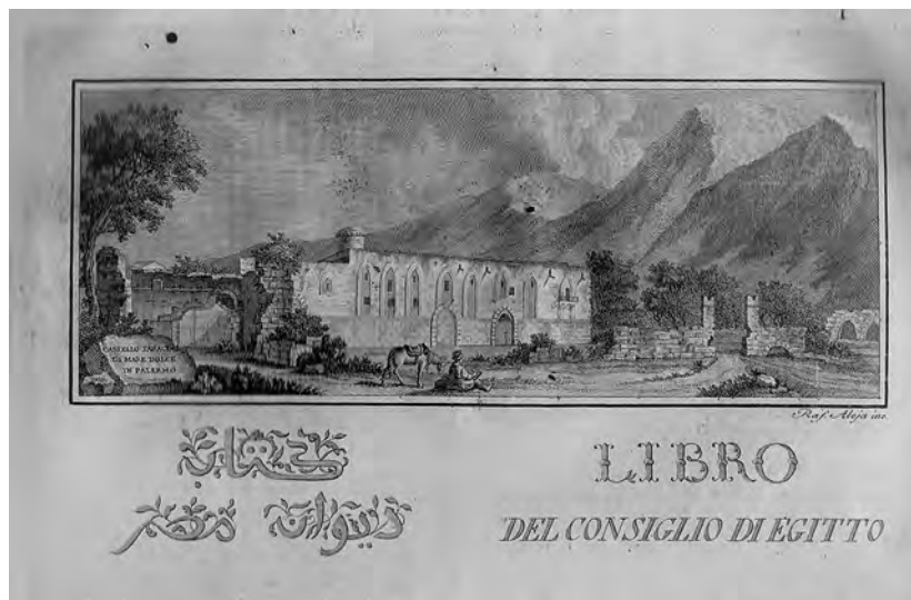
Figure 6. Drawn by Dufourny from original by Raffaello Ajola Castello Saraceno di Maredolce in Palermo. Gabinetto Disegni e Stampe, Palazzo Abatellis Regional Gallery, Palermo, n. D313.@

Another element that can’t be ignored is the finish of the royal palace: white stucco. This is certain because until the progressive renovation of the palace won’t scrape away the last layer of plaster, it’ll be possible to imagine the external appearance of the building. It’s therefore possible to observe that Maredolce was also covered in white stucco, as was Altofonte. The city still has a wall today that, until a few years ago, shined because of the bright white finely decorated with ‘conci’ (Meli, 1990). The big building complex, being the king’s private property, was not open to the public.