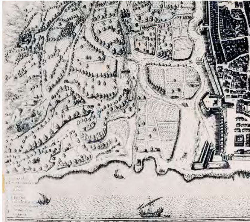
Figure 3. The Arcs of Saint Ciro.

woods, forests and the Macchia (Mediterranean shrubland) probably occupied most of the territory. In fact, it's important to specify that we don't know the exact borders of the "old park" even though we do know that beyond the Eleuterio river laid the Rebuttone feud. More to the west, on the Moarda coast, was the palace of Altofonte. It had two streams, which still exist today, and was surrounded by forests and/or shrublands that reached all the way to, and comprised, the territory adjacent to Partinico. It is now necessary to establish a point of reference to deepen our excursion and this could be represented by the map drawn by Orazio Maiocco of which we know the edition published by Marco Duchetto in 1580/1602 (fig.3).