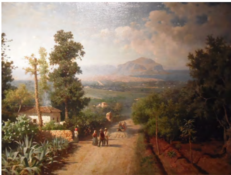
Figure 5. Francesco Lojacono (Palermo, 16 maggio 1838 –Palermo, 28 febbraio 1915), Ph.: Muesse - Galleria d’Arte Moderna(Palermo-Italy). You can see the centenarian olive tree on the right. The poplars on the left. In the background the dark green of the first citrus groves.