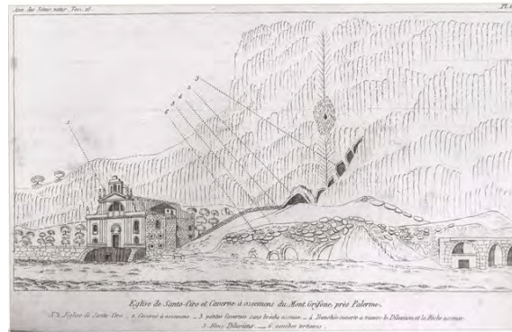
Figure 4. Reconstruction of the monumental system under Grifone mountain: the church of Saint Ciro, the Arcs and the caverns with rests from Neolithic era (Turnbull, 1831)

The road that crossed the original riverbed of the Oreto river on the Ponte dell' Ammiraglio (lit. Admiral's Bridge), is evidently restricted along its oriental perimeter by the territories of San Giovanni dei Lebbrosi of which one can still see the portico from the 1400s. The bridge is strong evidence of a landscape design which suggests a need to manage power rather than make an economical use of the country. Maredolce (Fawarah) was in fact the winter and spring residency of the royal family. The summer residence was in Altofonte instead (De Simone, 2014). Even in the context of the geographical schematizations of the map, it is possible to sense the presence of crops and uncultivated areas that correspond to the alluvial areas and the Oreto river's mouth of which the different branches and crossings were marked. There we find the Ponte dell' Ammiraglio, "lo ponti del Miraglia", along with a small nameless bridge on the second river branch caused by inundations. These inundations will characterize the city in many ways from the second half of the 1500s to today.