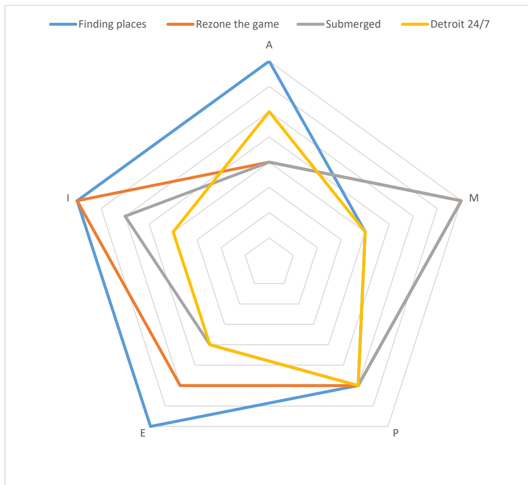
Figure 3. Weights in cases for each element of the AMPEI