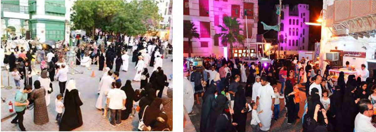
Figure 3. Shows how the space is crowded in night more than in day light