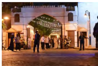
Figure 4. Shows the Huge Gates of the festivals that are open for people only

The enclosure of the urban space helps in arranging the movement of people inside and keep it smooth and easily. In addition, people can knew the initial start of the festival and lead them to have a one-way circulation and assure that they will pass through all the activities held there.