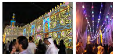
Figure 11. Shows how famous places are decorated and the lighting of paths

Historic Jeddah Festival is formed in order to show all things about the history and traditions of this place, as it is the initial core of Jeddah. Many events happened there and some famous people used it, so stakeholders and organizers consider it as an open exhibition where people should pass through all its parts. In order to facilitate the movement and avoid informal ones, Signs are used and sometimes they put barriers to separate between both directions. On the other hand, people can move freely in all paths during the normal days.