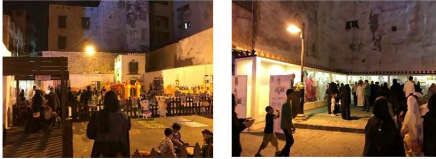
Figure 8. Shows how the nodes can be used for activities or open galleries