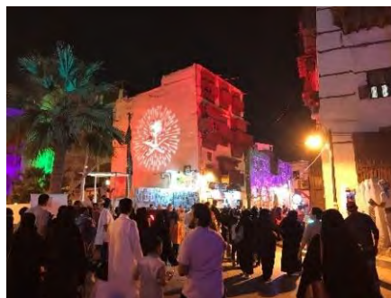
Figure 7. Shows the gathering node near gates