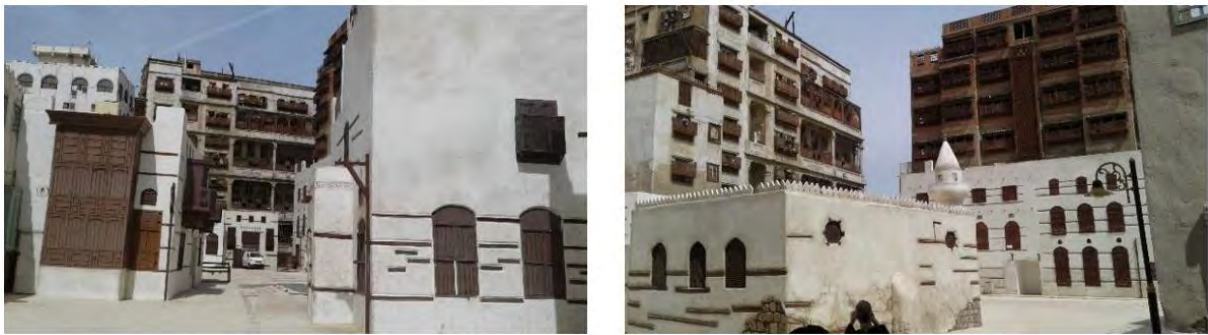
Figure 6. Shows that some of the nodes are empty and without any theme or activity in normal

In normal days, the central poles (Nodes) in the site are always empty, no theme or activity there and there is not any use for the central pole (nodes) (Fig.6).