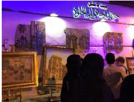
Figure 9. Show art exhibition for talented people