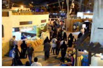
Figure 5. Shows how people can move safely and free during the festival