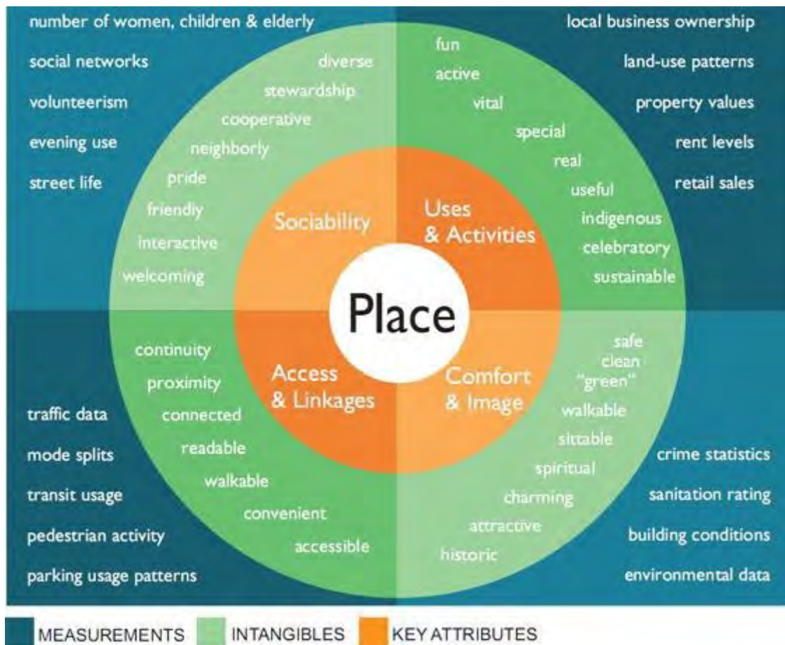
Figure 2. Shows Place Making Elements

circulation routes, so informed socialization could be formed as it attracts visitors and generates economic benefits (Morgan, 2007).