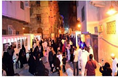
Figure 12. Show how people act with the displayed elements and what slower the movement among the paths

There is another benefit from the one-way circulation to the shops' owners; they will be assured that all people will pass by their shops. In addition to that, organizers used the wall of the famous buildings there as form digital art with different shapes to make the paths livable and people do not feel bored, and the add light above the paths (Fig.11 a-b). Most of the secondary activities' rely upon the linear structure established for the organized event.