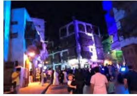
Figure 14. Show the place's identity while moving through paths