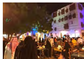
Figure 13. Show Cul de Sac as a social place

Furthermore, such a festival provides an opportunity to develop awareness of identity for local children who participate in it, and develop their skills and confidence in bodily performance as a means through which they can communicate identity and meanings to others.