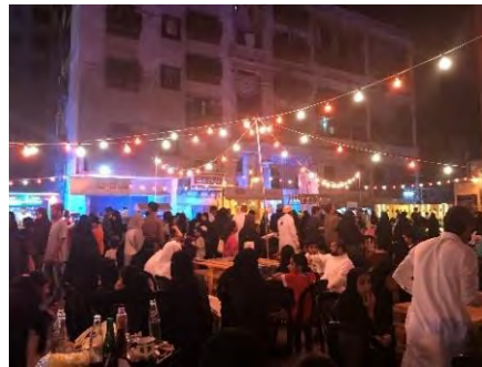
Figure 10. Show using end nodes as a social interaction space

Sometimes stakeholders and organizers add huge temporary structure elements (Inflated Building) for shows that talk about history, local life and traditions. The organized events of the festival go hand-in-hand with physical planning to develop the public realm as a socio-cultural medium for interaction.